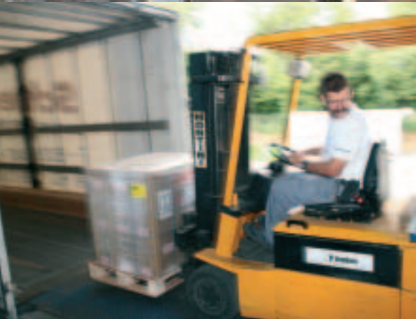
The proximity of the border and our nearby turnover and warehousing possibilities allow for flexible and effective customs clearance.

All these activities are supported by high-performance logistics software.